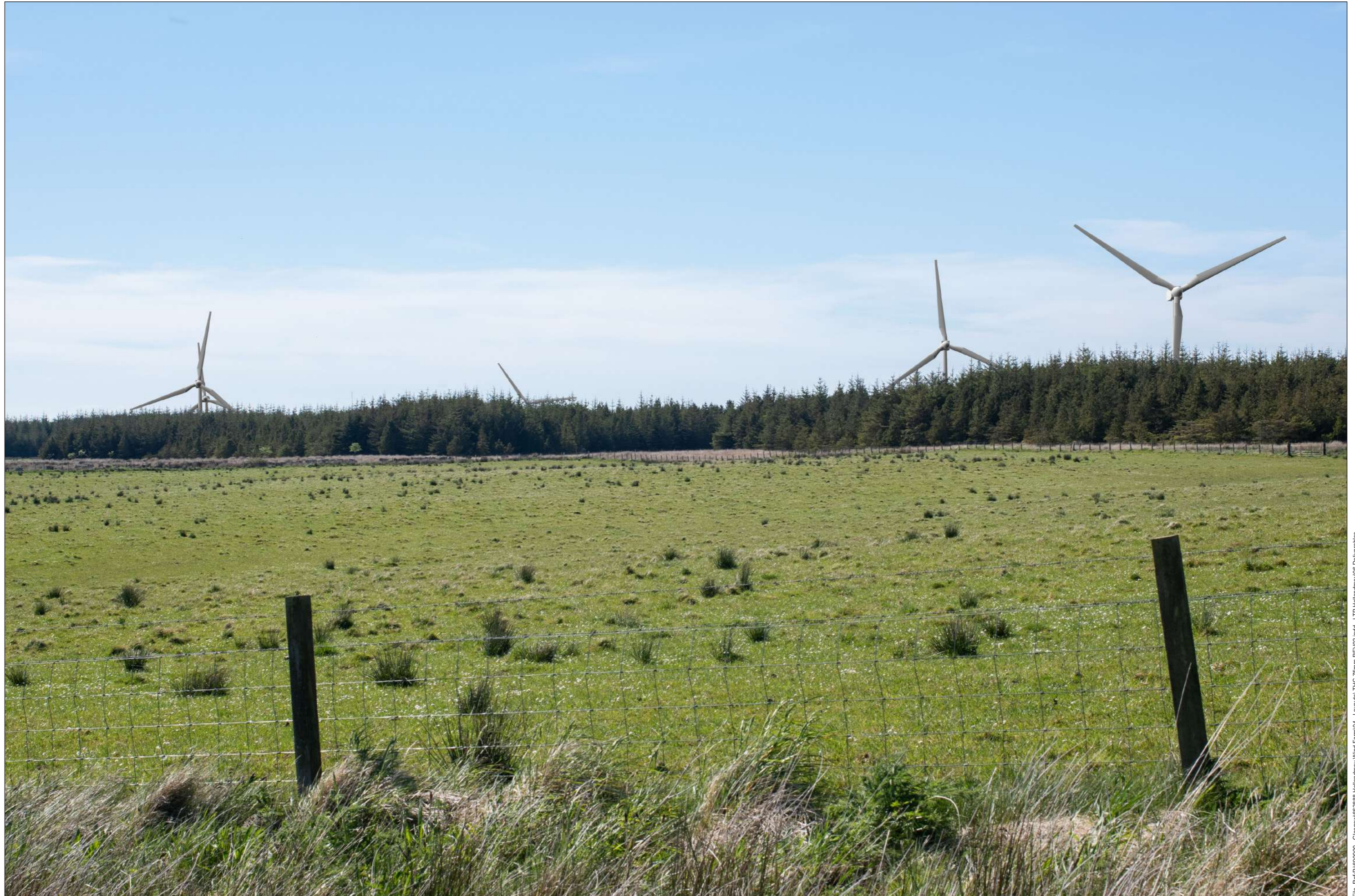
Figure: 7.22-THC-04 Viewpoint 9: Brabster

This image should be viewed at a comfortable arm's length (Approx. 500 mm)