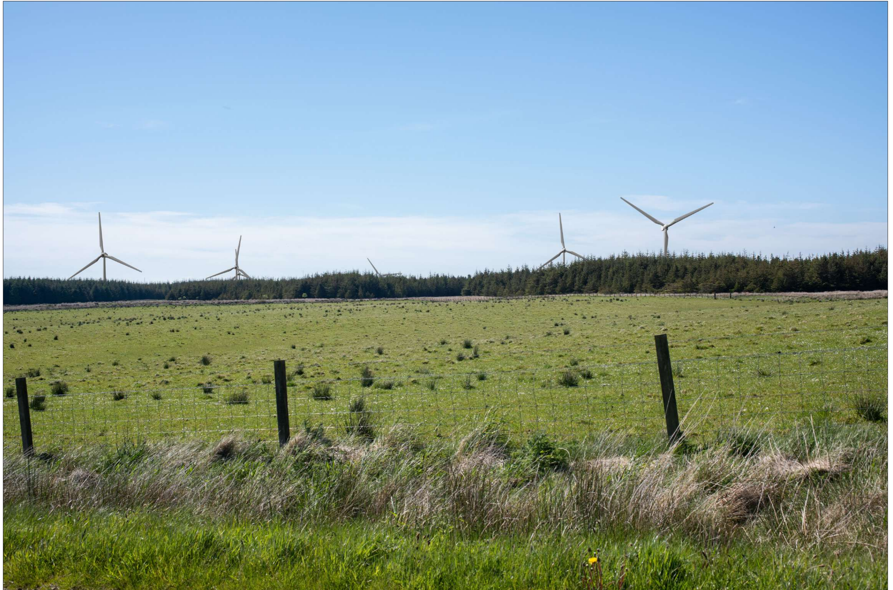
Figure: 7.22-THC-03 Viewpoint 9: Brabster

When viewed at a comfortable arm's length (approx. 500 mm), this printed image is representative of our detailed central vision, but is not representative of scale and distance.